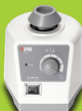
Nr. 1 MX-S Variable speed Vortex Mixer