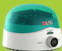
Nr. 1 D1012UA High Speed Micro Centrifuges