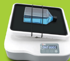
Nr. 1 SK-R1807-S Intelligent Transference Decolorizing Shaker