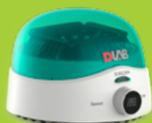
Nr. 1 D1012UA High Speed Micro Centrifuges