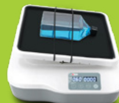
Nr. 1 D1012UA High Speed Micro Centrifuges