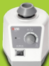
Nr. 1 MX-S Variable speed Vortex Mixer