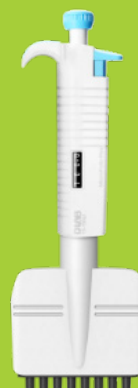
MicroPette Plus 8-channel Adjustable Volume Mechanical Pipettes (magnetic suction model)